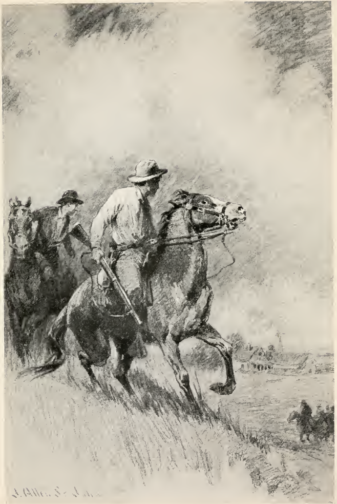
The boys saw the guerillas were getting ready to attack from all sides